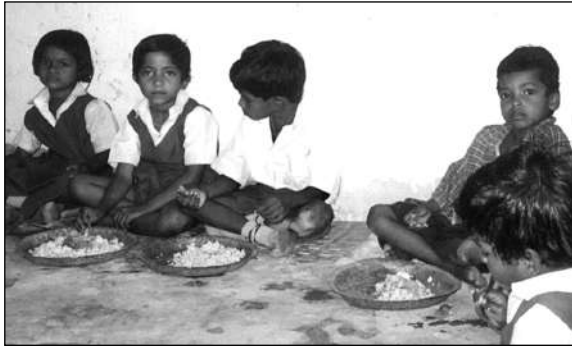
MID-DAY MEALS BEING SERVED AT THE PRATICHI SCHOOL