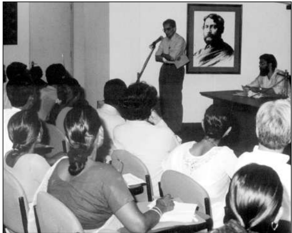
AMARTYA SEN'S INAUGURAL ADDRESS ON THE ROLE OF PARENTS AND TEACHERS IN PRIMARY EDUCATION, AT THE WORKSHOP

The workshop discussed several issues important for the effective distribution of school education, like ways of fighting the ill effects of discrimination made on the basis of class, caste, religion, gender, and other social evils. Various ways of ensuring the quality of primary education were discussed, and suggestions of parent-teacher com-