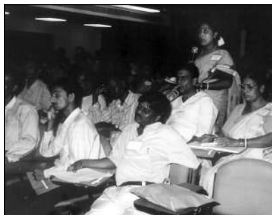
AT THE PARENT-TEACHER WORKSHOP IN SANTINIKETAN, JULY 2002