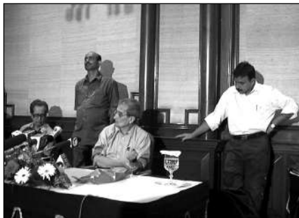
AMARTYA SEN AND OTHERS AT THE RELEASE OF THE PRATICHI EDUCATION REPORT I

i. On 16 August, 2002, at an impressive gathering of press and scholars